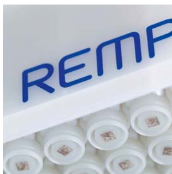
Storage Tube Rack with 2D Code

Amphora’s REMP system includes the Tube Punching Module™ (TPM) and associated devices, the Reatrix™ DataMatrix Scanner for reading the storage tube rack bar codes and 2D barcoded REMP 96 Tube Technology™ consumables. The TPM is a desktop device that allows PC-controlled selection of REMP 96 (or 384) tubes, which are directly transferred from storage tube racks into delivery tube racks for collecting and reformatting. The TPM performs the transfer through a single axis movement, reducing handling error