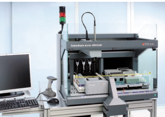
The Freedom EVO Clinical 75 workstation for nucleic acid extraction

Tecan's Freedom EVO® Clinical 75 performs fully automated RNA and DNA extraction from up to 24 samples in 3 hours, using magnetic microparticle processing. The Laboratory LABCON-OWL in Bad Salzflfen, Germany evaluated the instrument's performance in combination with the Abbott RealTime™ HIV-1 and HCV assays, and compared it to the previously validated Abbott m2000™ processing system.